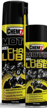
MX3 CHAIN LUBE Product Code 7652 | 250ml Product Code 7655 | 500ml

Suitable for helmets, gloves, leathers, boots, mudguards, farings, exhausts, instrument panels & all surfaces requiring coating & long lasting shine.