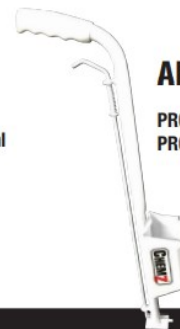
AEROSOL SPRAY WAND PRODUCT CODE 7991 suits a 500ml can PRODUCT CODE 7993 suits a 400ml can