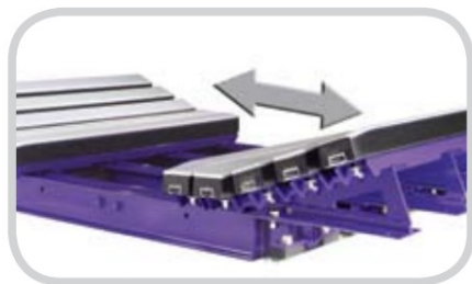
Each half of the bed slides out for easy maintenance.