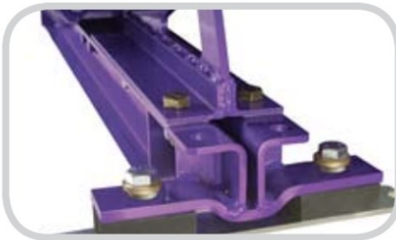
Isolation mounts provide a second level of impact relief.

DRX Impact Beds separate in the middle, allowing the two sides to slide apart and out. This unique Slide-Out Service feature gives direct access to all the bars and bolts for quick, easy and safe maintenance. The beds offer rapid conversion from run position to service position and back again. Other beds require that a two-man crew spend up to eight hours replacing the bars. With a DRX bed, that same crew can finish a complete bar change-out in just one to two hours. Further, the DRX line is designed to work with any common rubber impact bar. Use existing stock and maintain a smaller inventory for future change-outs.