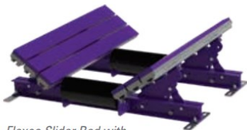
Flexco Slider Bed with Standard Roll (EZSB-C)