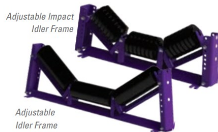
Adjustable Impact Idler Frame