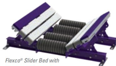
Flexco® Slider Bed with Impact Roll (EZSB-I)