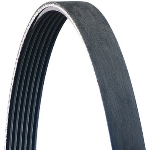
J cross-section from 13" to 98"