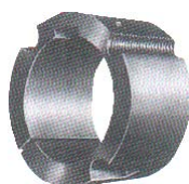
Taper Bush Data